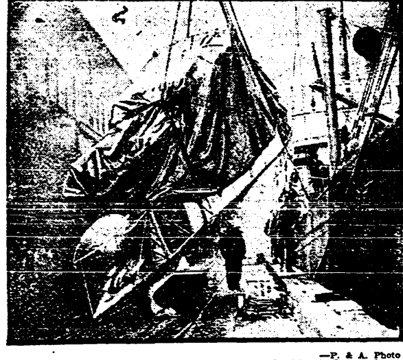
The mighty Norge, which sailed alone over the North Pole, where no common ship has ever been, was forced to accept a lift from an ordinary steam freighter to get back home in Italy. The picture shows the Norge being transferred at San Francisco to a ship for Italy.

WEEVIL BLAMED FOR DECREASES IN COTTON LAND