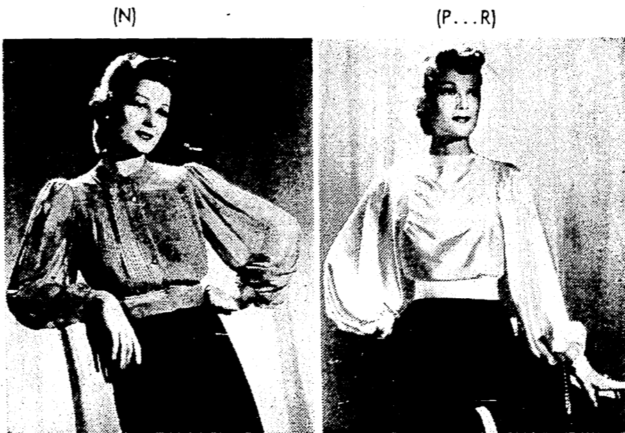
N—Triple sheer with pleated bosom and gypsy sleeves. Sparkling buttons. Sizes 30 to 38, in white, eggshell black, royal blue, green, red ..... 3.00

Featured in the October Issue of Mademoiselle Shown Exclusively in Holmes Sports Shop, Second Floor