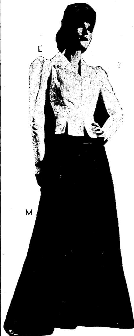
L—Celanese rayon moire taffeta jacket with zipper front. 30 to 38 in white, black, red, royal blue ..... 3.00