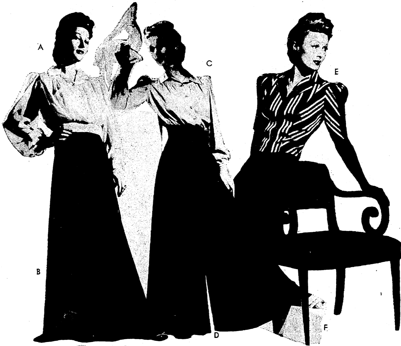
A—Triple sheer band-bottom blouse in white, blue or pink. Sizes 34 to 38 ..... 3.00